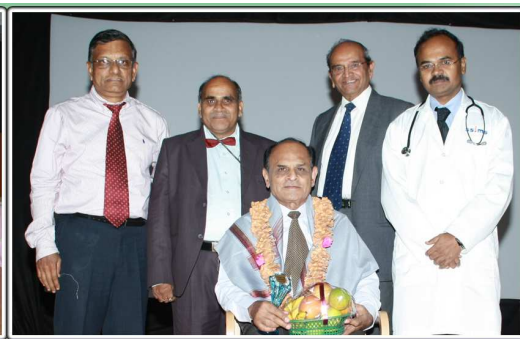
Doctor's Day Celebration