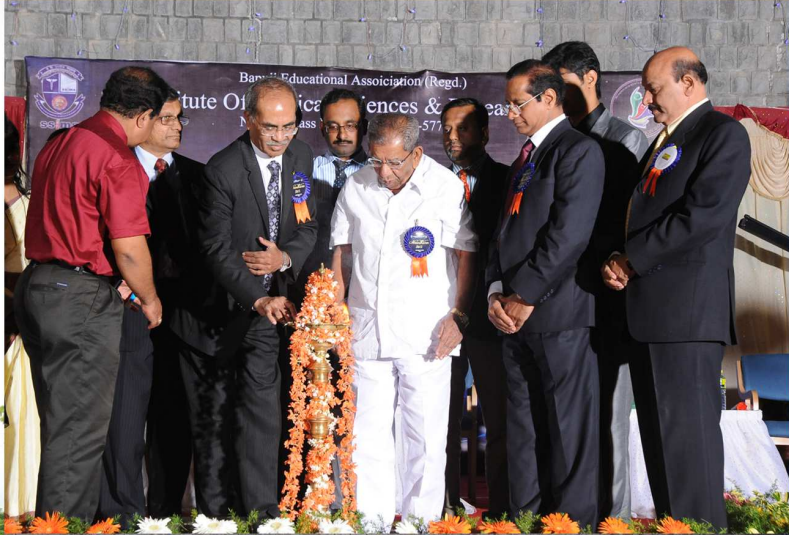
Inauguration of Niranthara -13 Cultural day