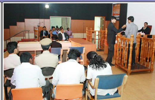
Naithik 2013-1st UG Conference at SSIMS&RC