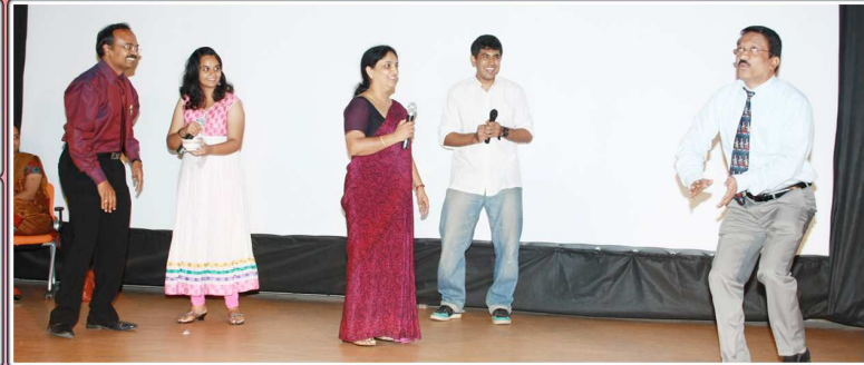
Teachers Day Celebration