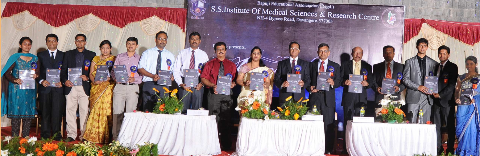
Release of Syncitium-13